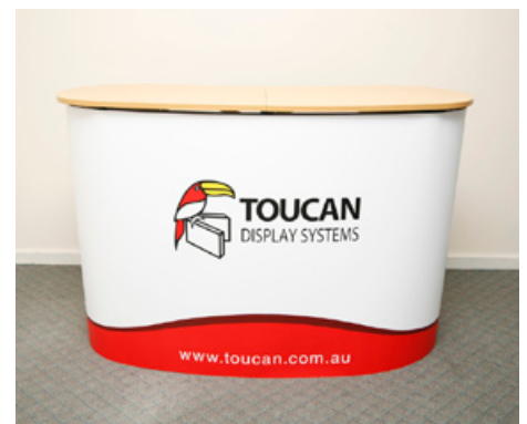
Place the table top across the frame to complete your popup counter. Holes on underside of top align with pins on frame.