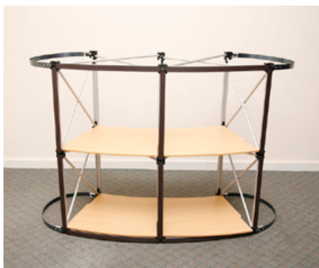
Add magnetic strips to the sides to support the graphic skirt.