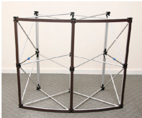
Take the magnetic bars out of the bag. Magnetic bars attach to the frame.