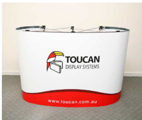
Attach graphic skirt to frame - utilising the magnetic strips.