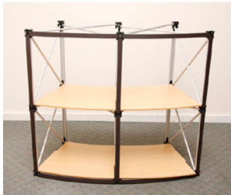
Add the four storage shelves.