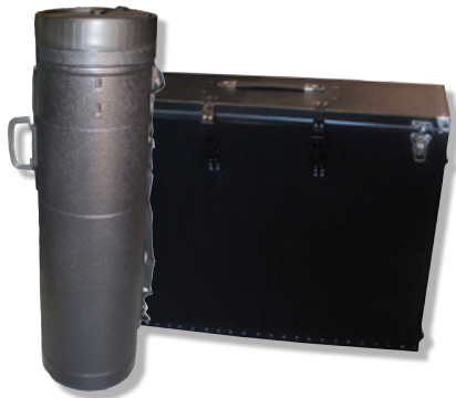
Everything you need to assemble your display is stored in these handy travel cases.