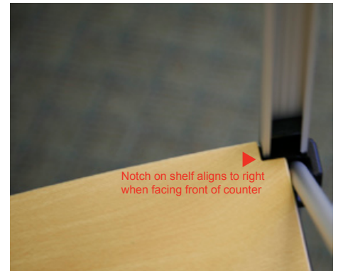
The shelves stabilise the frame. Notches on shelves align to front right when placed in frame.